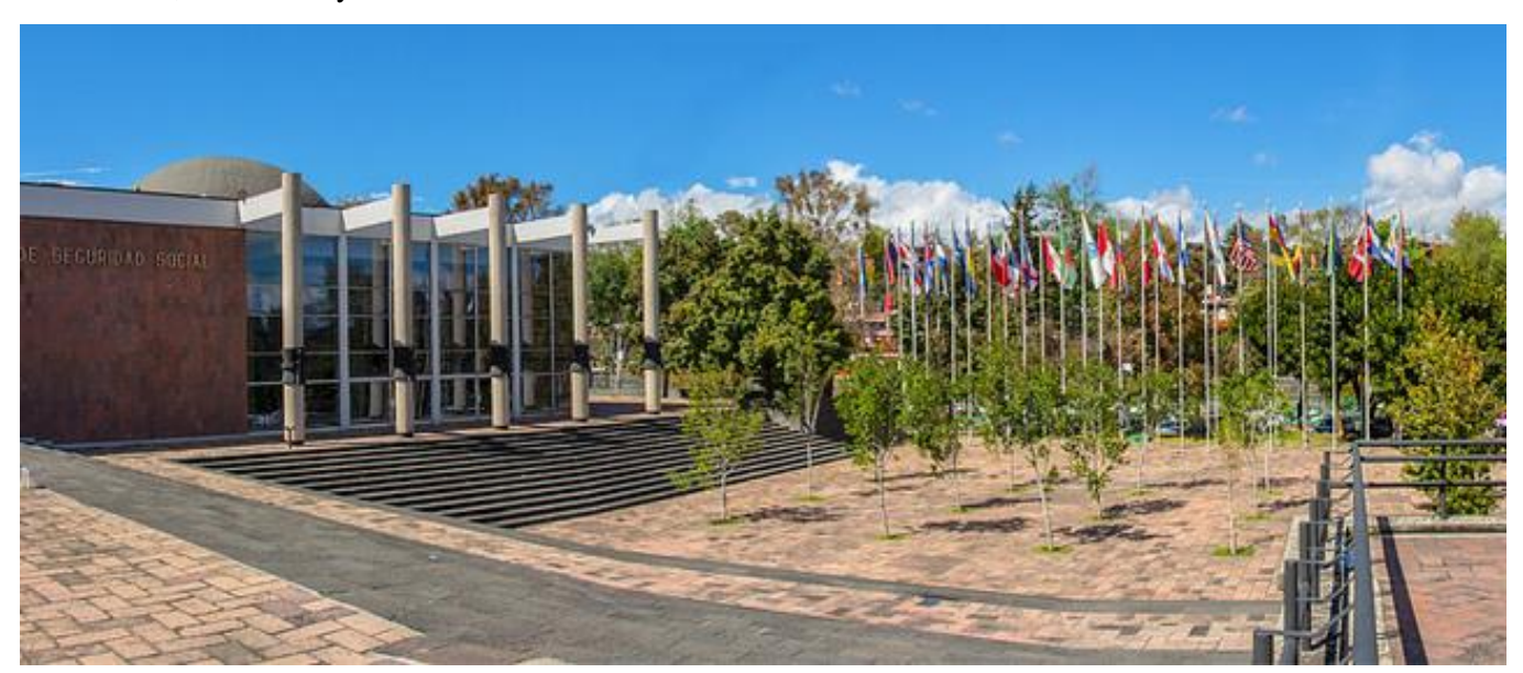
Inter-American Conference of Social Security (CISS) – San Ramon Avenue, San Jeronimo Lidice, Mexico City